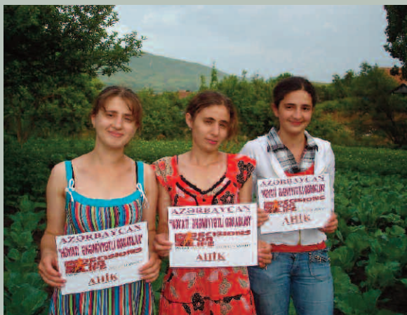
Women attending a Decisions for Life campaign activity.

T he AHİK, in cooperation with Khidmat-Ish, an UNI/IUF affiliate, has involved successful Azeri women in its campaign as role-models, using them in story telling sessions to inspire younger women. Theatre techniques were also used during its 8 March activities, dedicated in 2010 to Decisions for Life. The 8 March event received wide media coverage, and the theatre production attracted 360 women participants. AHİK has also published a book on the “Rights of young workers”, which covers international conventions, the European Social Charter, the Labour Code of Azerbaijan and other national laws. Trade union membership has steadily increased since the start of the campaign, notably among market traders and telecommunications workers.