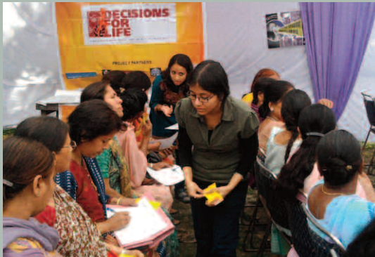
International Women's Day event in India.

Between the launch and the June 2010 event on the International Day against Drug Abuse and Illicit Trafficking they succeeded in bringing over 1,109 women participants to their activities.