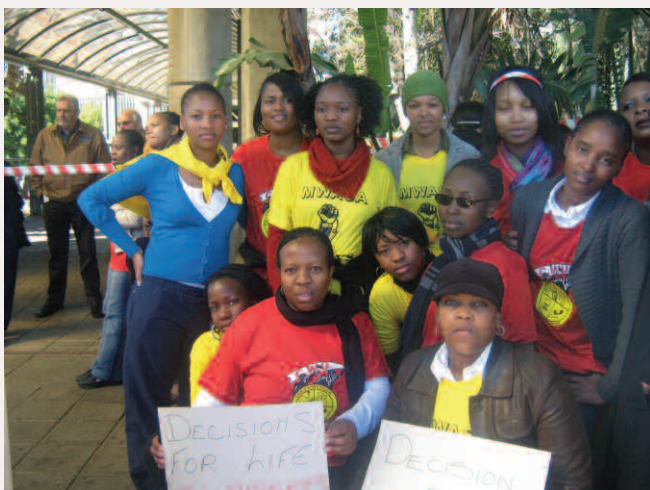
A Decisions for Life team supporting an SABC strike.

T he Labour Research Service (LRS) coordinates the campaign with all four national centres affiliated to the ITUC and three UNI affiliates. This coalition was later broadened as they formed networks with NGOs and cultural groups, extending the reach of the campaign.