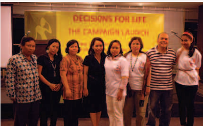
The campaign launch in Indonesia.

So far they have found that informal, face to face contact works best to win women's trust. The KSBSI team is also reaching out to young women using the communication tools they use most, such as Facebook and Twitter. Not only have they improved communications and reached a wider audience, they have also improved the image of the union which is now seen as an organisation for young workers.