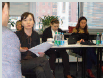
The regional campaign partners meet in Minsk, Belarus.

employed women. By July 2010 the NGO had its own office, it had developed cooperative relations with local authorities and other organisations and had won credibility among the self-employed. Having been given the space to discuss their problems, several groups of activists said they were motivated to work further on organising self-employed women. The plan is to work in stages to turn the NGO into a trade union.