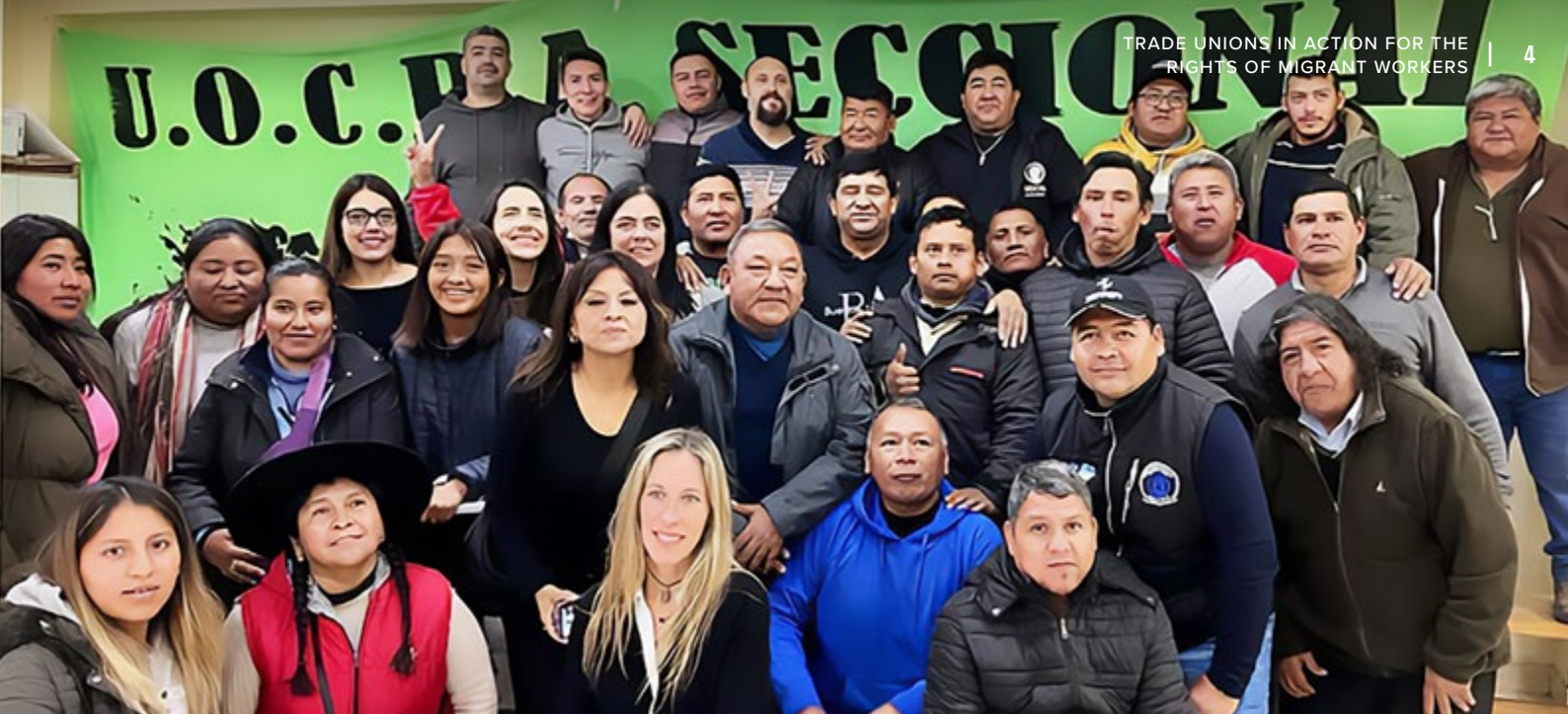
Argentina, CGTRA, Project Lazos