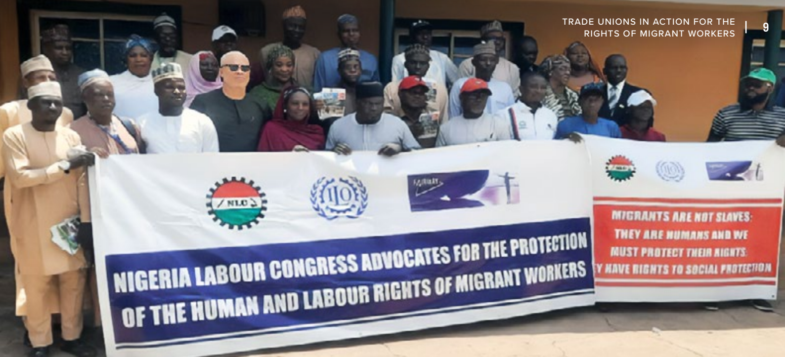
Nigeria, NLC, Migrant workers rights campaign rally