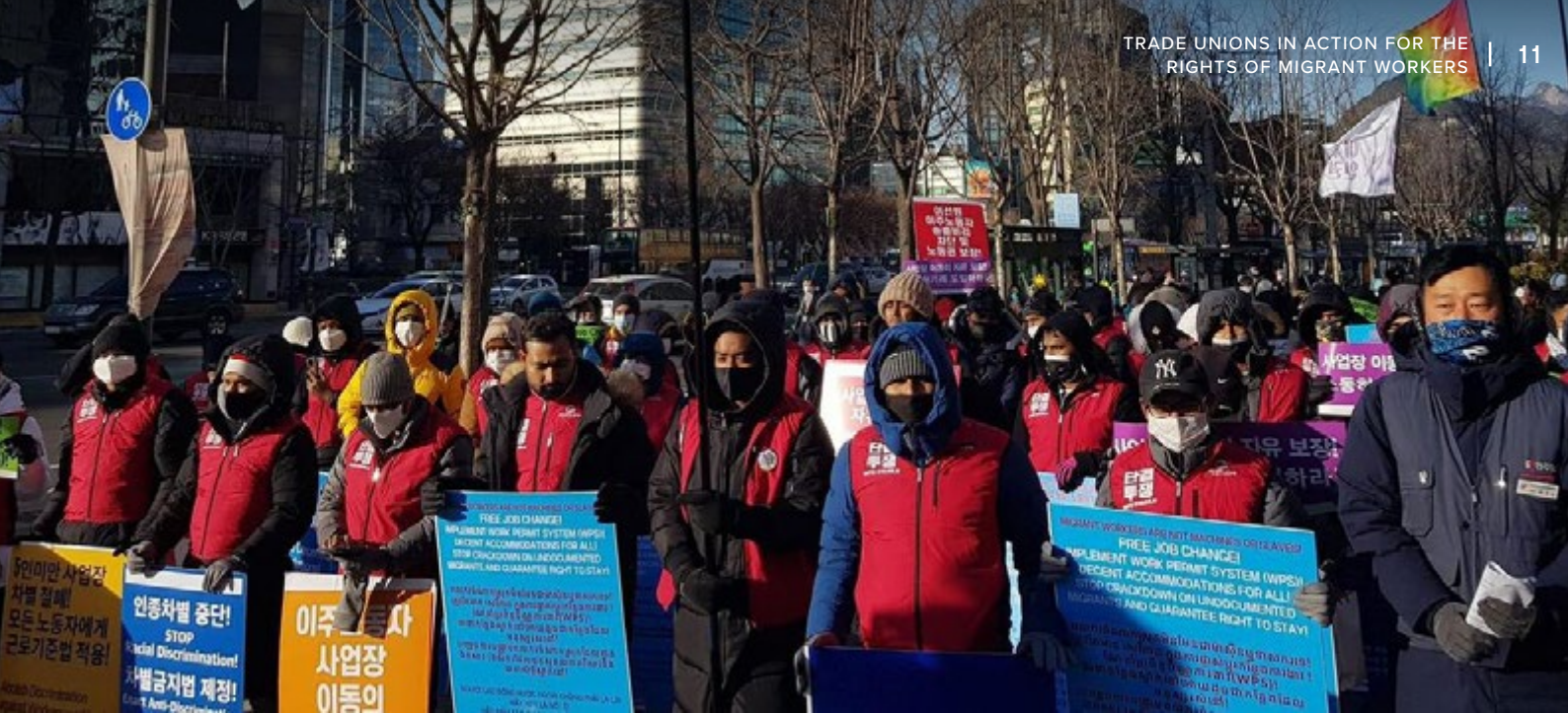
Korea, KCTU, International Migrants Day 2022