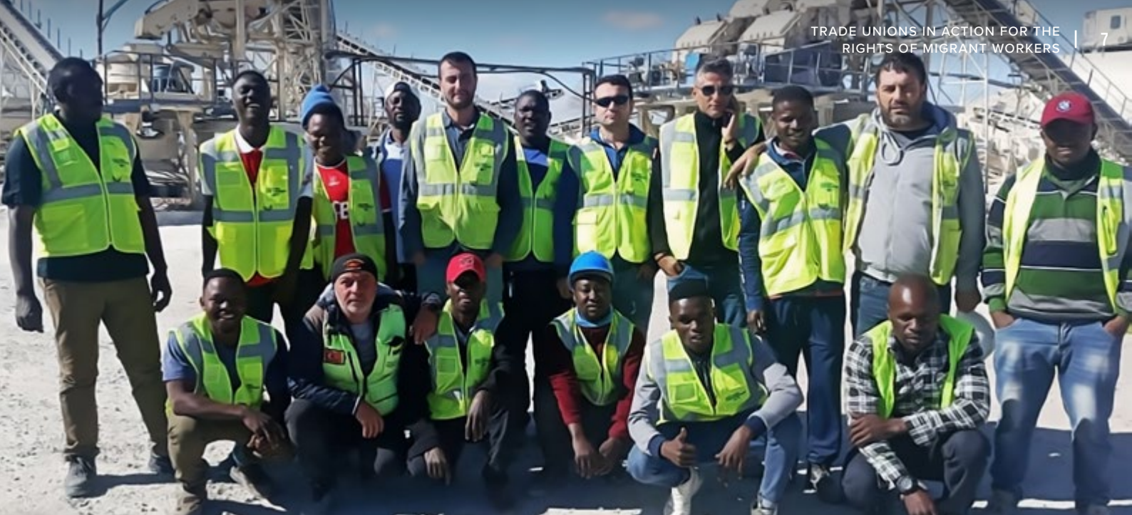
Tanzania, DISK and Dev Yapı-İş, Migrant workers from Türkiye on strike