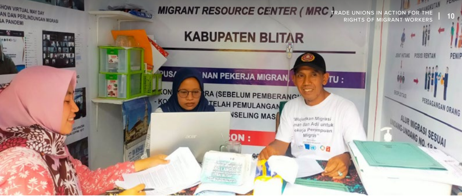
Indonesia, KSBSI, Migrant Workers Resource Center