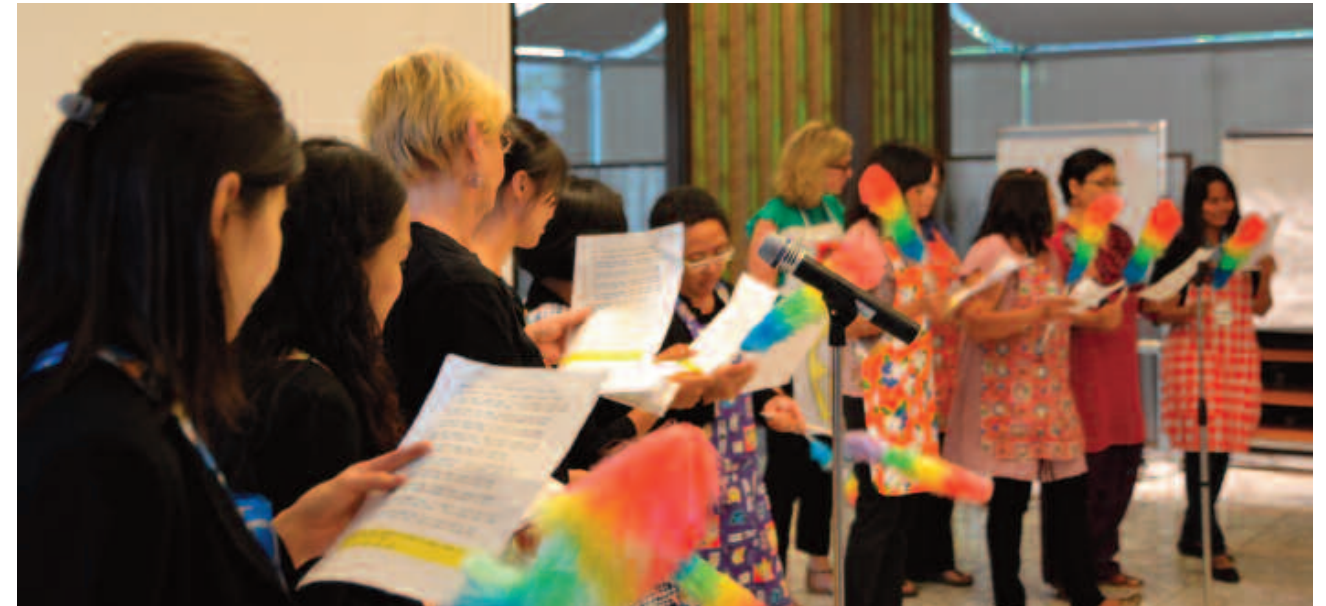
Representatives of domestic workers' groups called for ratification of C189 by performing a rap to government officials from Asia on May 31, 2013 during the event entitled "Protecting Migrant Domestic Workers: Enhancing their Development Potential." Advocates have used music, dance, and art to challenge and change attitudes towards domestic work.

and strengthened regional and global coalitions. As a result, new groups, networks, and alliances are being established and the membership of domestic worker organizations and trade unions is growing.