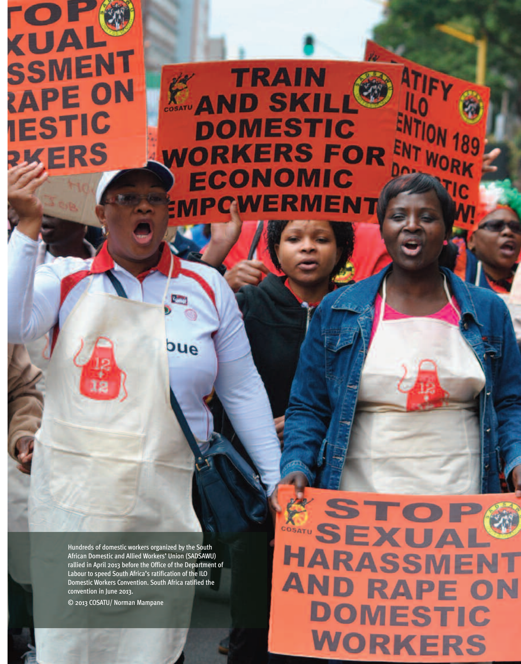
Hundreds of domestic workers organized by the South African Domestic and Allied Workers' Union (SADSAWU) rallied in April 2013 before the Office of the Department of Labour to speed South Africa's ratification of the ILO Domestic Workers Convention. South Africa ratified the convention in June 2013.

International migrants are another category of domestic workers who face a heightened risk of abuse, due to exploitative recruitment practices, restrictive immigration policies, language barriers, poor access to redress, and other factors. In many countries, employers routinely confiscate the passports or work permits of migrant domestic workers, leaving the worker vulnerable to arrest or deportation if they try to change employment or escape abuse. In Malaysia, migrant domestic workers must forego months of wages to pay for unregulated fees to unscrupulous recruitment agencies. In Kuwait, Human Rights Watch found that embassies of labor-sending countries received more than 10,000 complaints from domestic workers in 2009 for nonpayment of wages, excessive working hours, and physical, sexual, and psychological abuse. 17