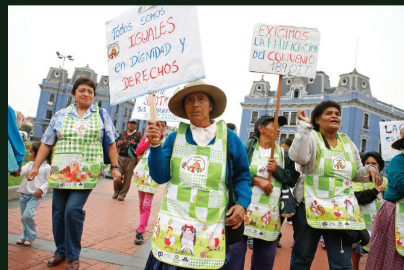
Domestic workers in downtown Lima, Peru demonstrate to demand labor protections, June 15, 2012. The placards (L-R) read, "We all have the same dignity and rights" and "We demand the ratification of the 189 ILO Convention."