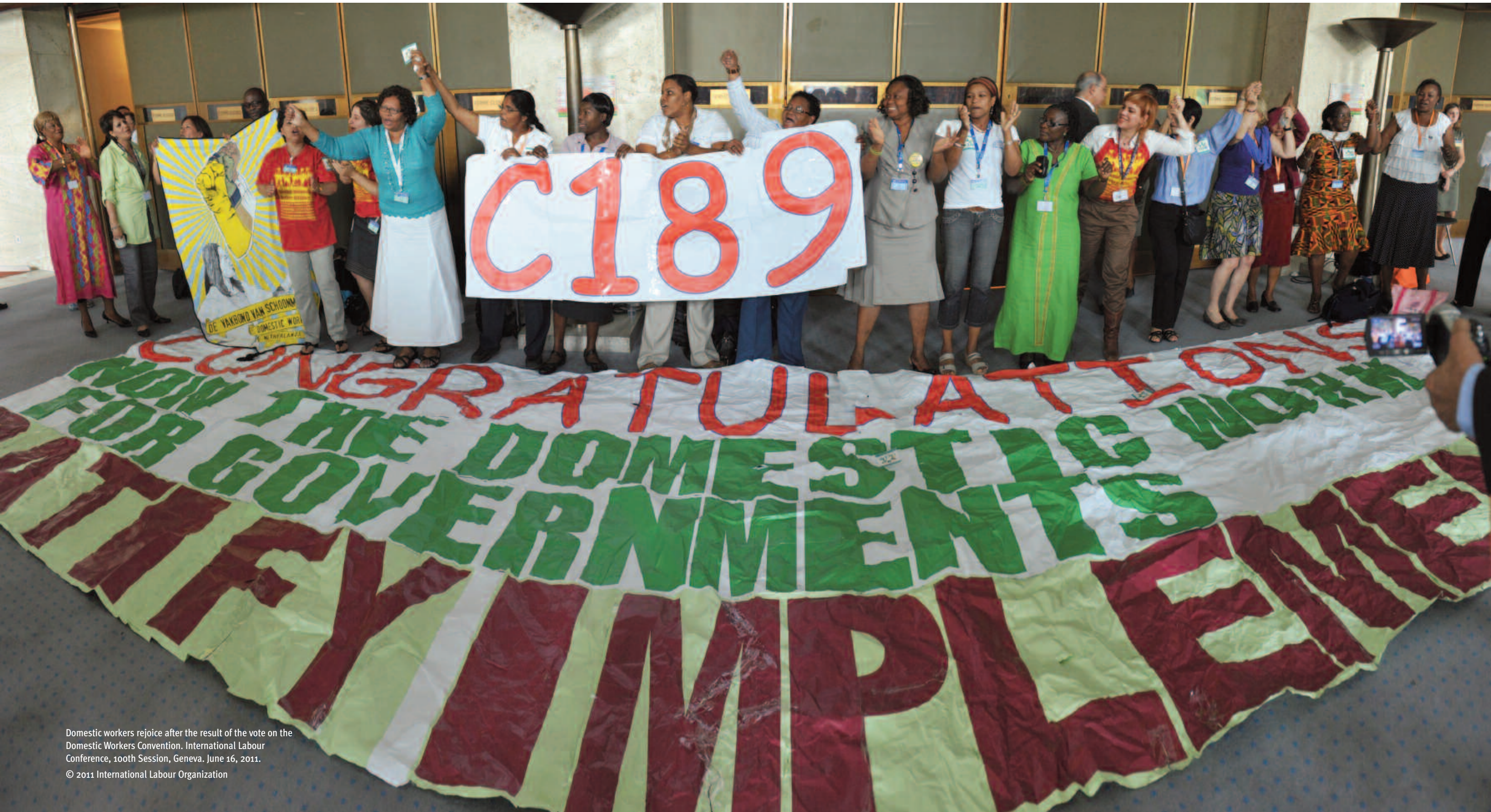
Domestic workers rejoice after the result of the vote on the Domestic Workers Convention. International Labour Conference, 100th Session, Geneva, June 16, 2011.