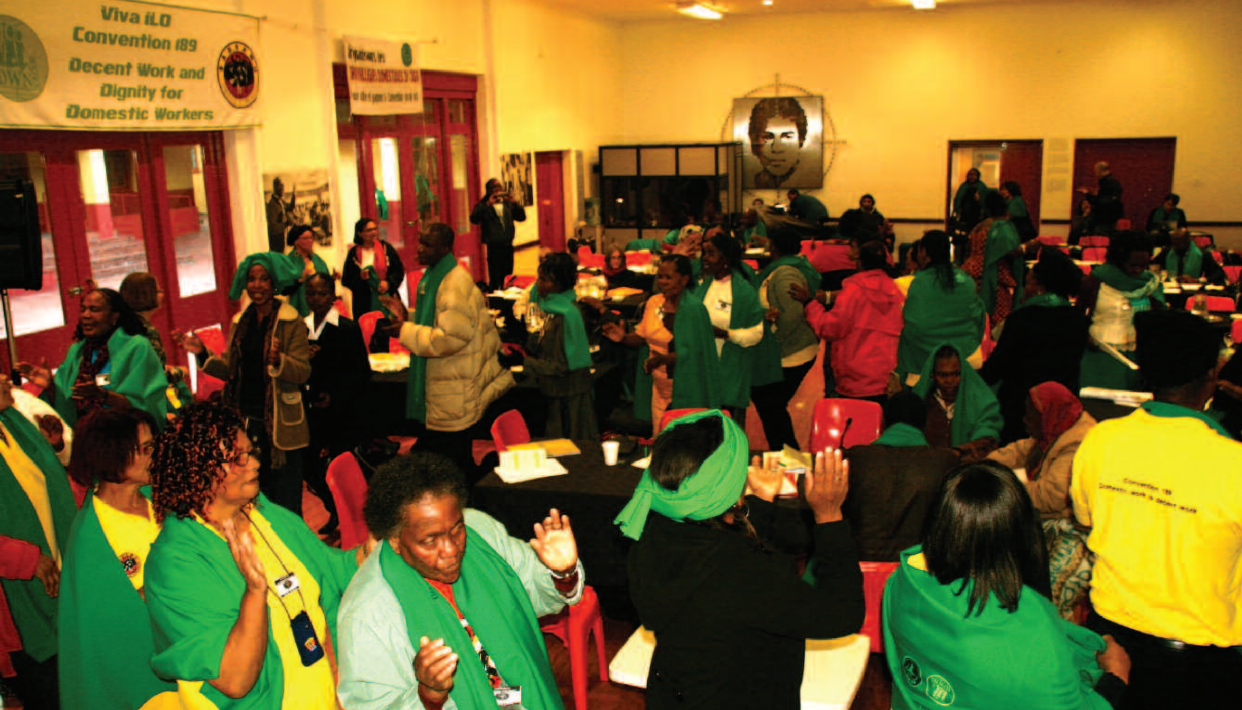
95 domestic worker representatives from groups in 17 countries launched the Africa Domestic Workers Network (AFDWN) in Cape Town, South Africa on June 16, 2013.