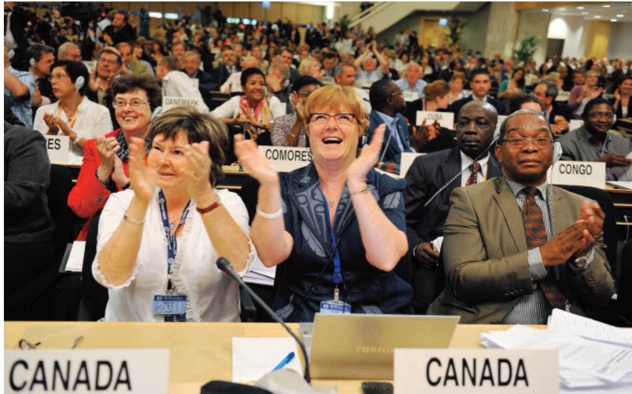
ILO delegates celebrate the final result of the vote on the Domestic Workers Convention. International Labour Conference, 100th Session, Geneva. June 16, 2011.