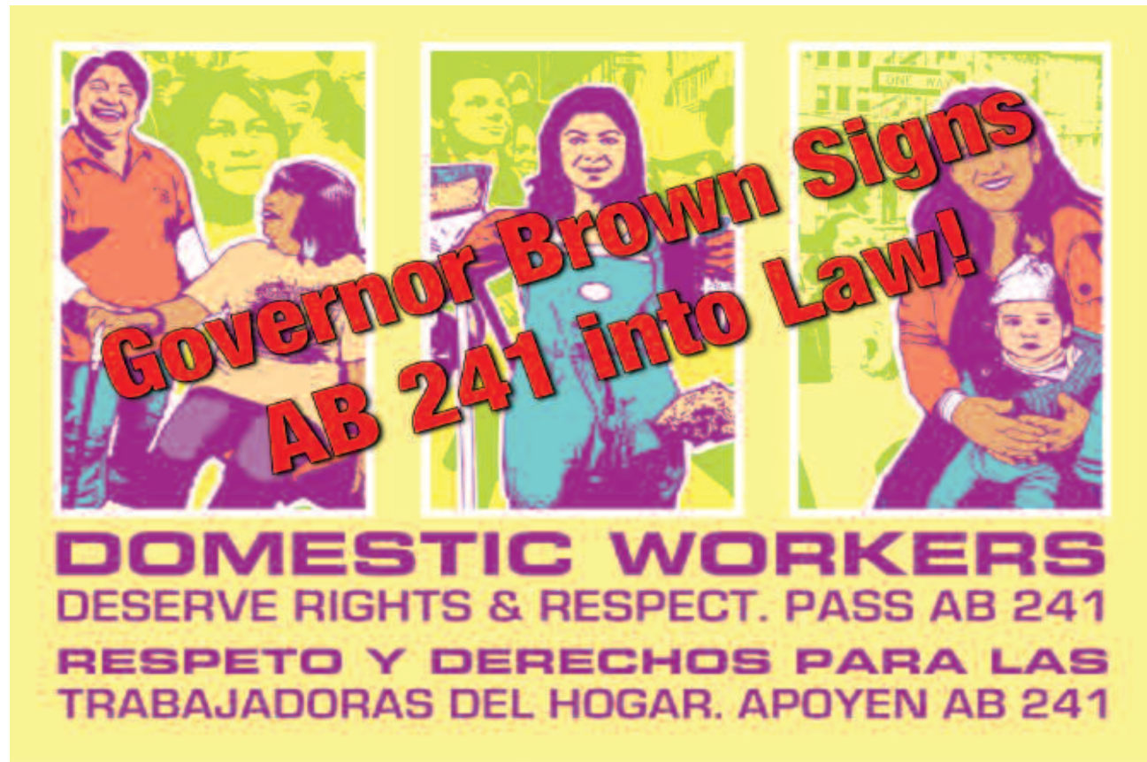
A poster distributed by the California Domestic Workers Coalition after Governor Jerry Brown signed the Domestic Workers Bill of Rights into law. The bill provides overtime pay for domestic workers in the state of California.