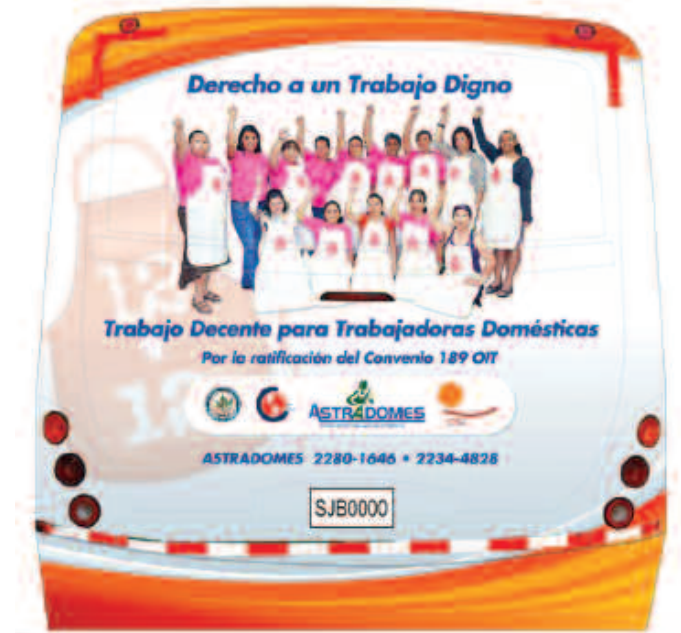
On December 12, 2012, public buses in Costa Rica carried billboards highlighting the global "12 by 12" campaign for ratification of the Domestic Workers Convention. Unions launched a national campaign to pressure Costa Rica's government to ratify C189.