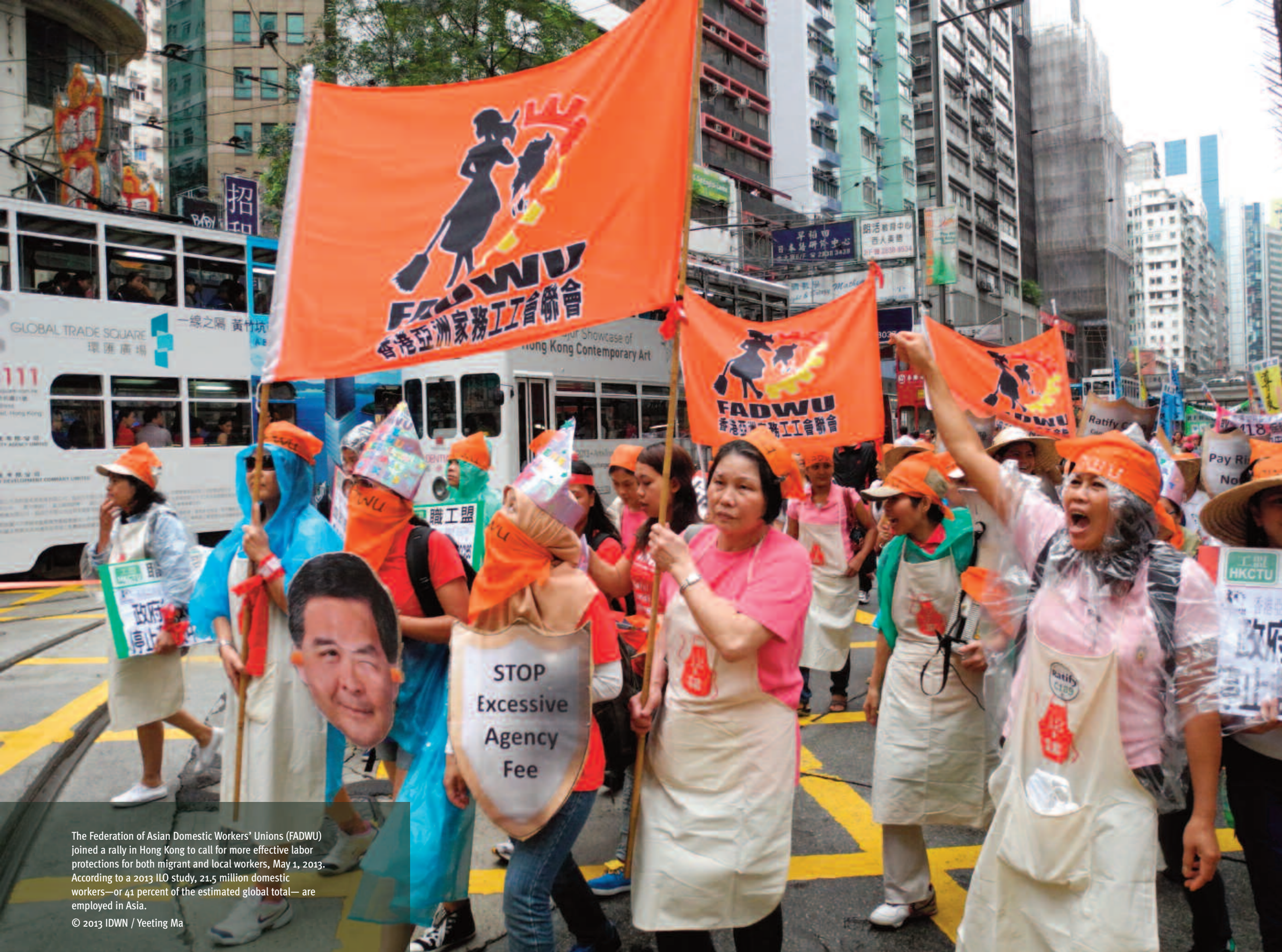
The Federation of Asian Domestic Workers' Unions (FADWU) joined a rally in Hong Kong to call for more effective labor protections for both migrant and local workers, May 1, 2013. According to a 2013 ILO study, 21.5 million domestic workers—or 41 percent of the estimated global total—are employed in Asia.