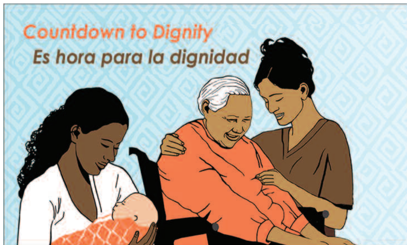
A poster by the National Domestic Workers Alliance calling activists to join hundreds of domestic workers across the United States in a social media rally to support dignity for domestic workers (#DWdignity) and labor protections for home care workers.