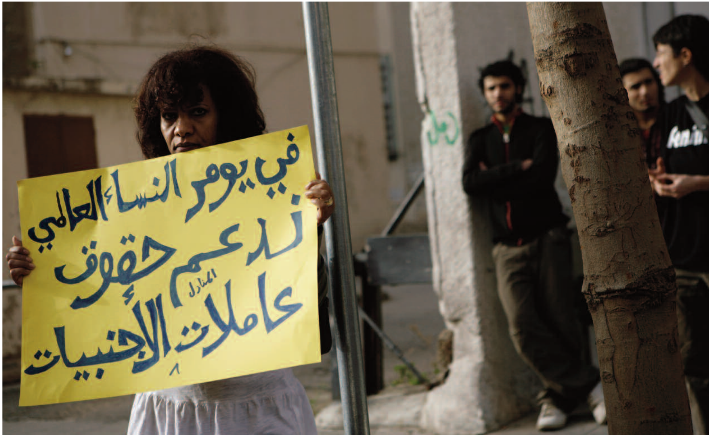
At a protest to demand that Lebanese authorities take measures to protect domestic workers, an Eritrean woman, left, carries a banner in Arabic that reads: “On International Women’s Day we support the rights of the foreign domestic workers.” Beirut, Lebanon, March 8, 2009.