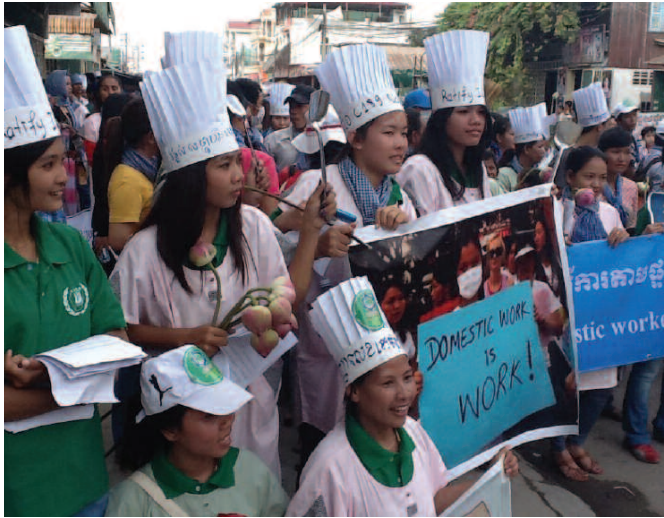
Domestic workers and their allies march to the Cambodian Ministry of Labor on Human Rights Day, December 10, 2012, to urge the government to ratify the Domestic Workers Convention.