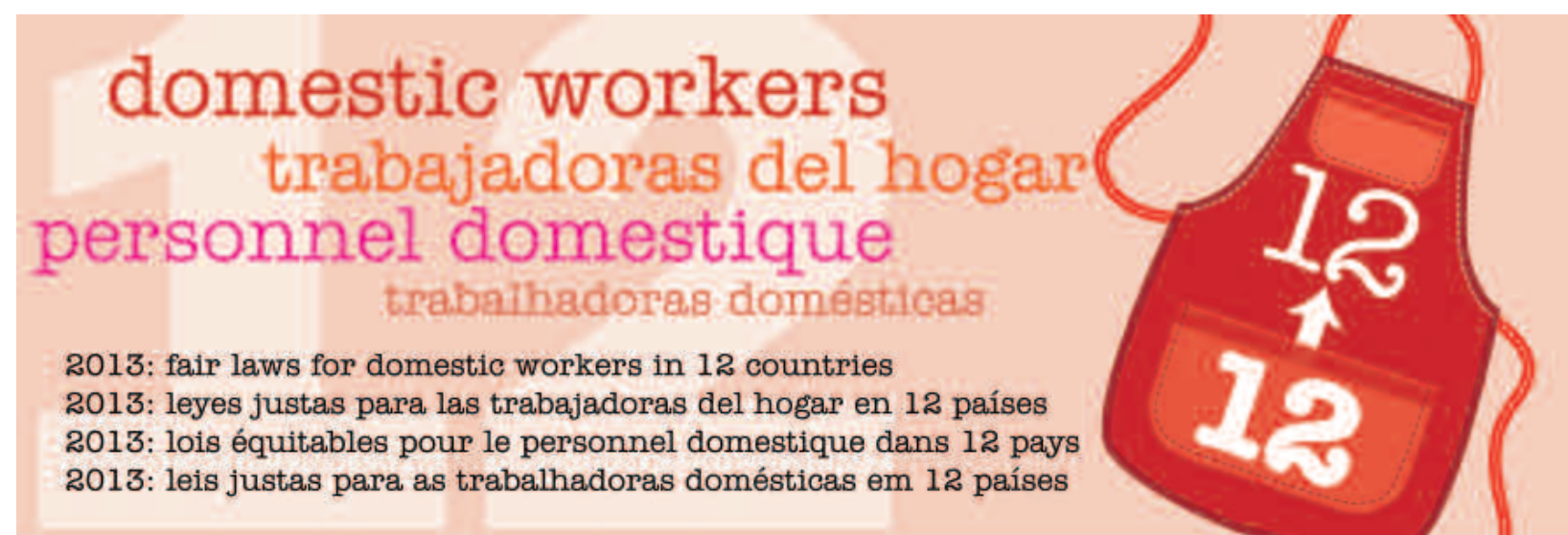
A flyer from the June 2013 “12 by 12” ILO Domestic Workers Convention ratification campaign newsletter. On December 12, 2012, “12 by 12” campaigners in more than 50 countries coordinated their public events, providing regional and global resonance to local domestic worker campaigns.

Migrant domestic workers are another group who find it particularly hard to organize, because of restrictive immigration rules and language barriers, among other factors. Recruiting organizers fluent in domestic workers' native languages, organizing events around cultural and religious holidays, publishing rights materials in relevant languages, and setting up help desks in airports and shopping malls have been key strategies to mobilize migrant domestic workers. Justice 4 Domestic Workers (J4DW) in the United Kingdom is an organization of migrant domestic workers originating mostly from Asia and Africa. Members of J4DW pool their financial resources to provide emergency accommodation, food, and clothing for other domestic workers in need. 60 It was founded by eight domestic workers in March 2009 and expanded its membership to approximately 600 active members.