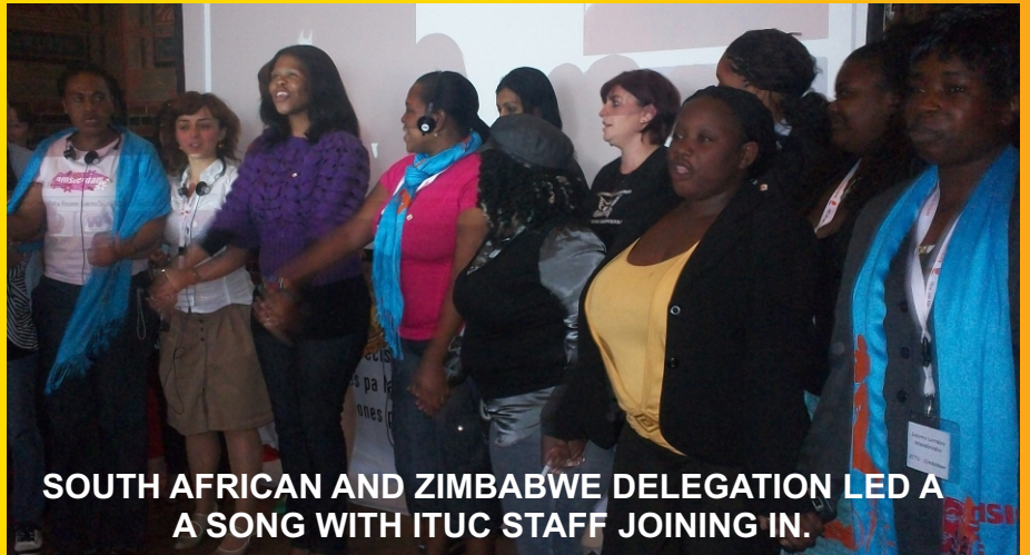
SOUTH AFRICAN AND ZIMBABWE DELEGATION LED A SONG WITH ITUC STAFF JOINING IN.