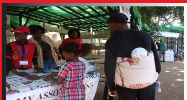
Sharing family responsibilities was one of the thematic areas discussed at the bookfair & the DFL team enjoyed it when a practical example of a gender sensitive man visited the stand with his baby strapped on his back.